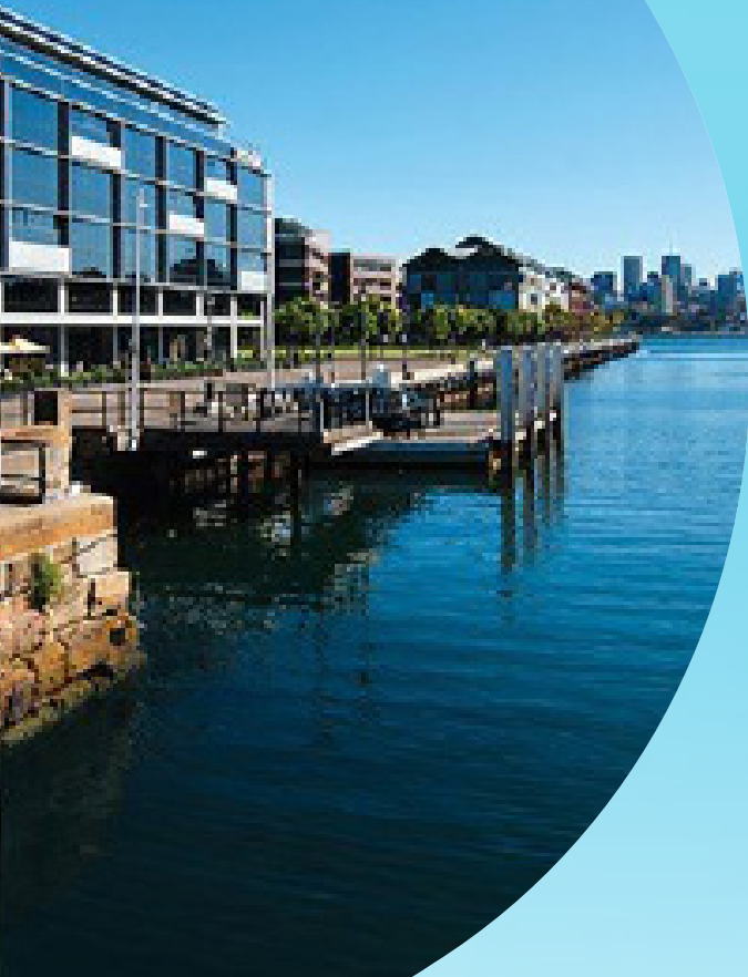
Doltone House Darling Island Wharf Sydney, Australia