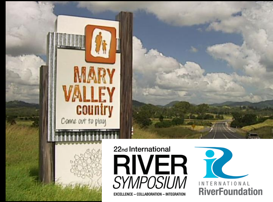
Mary Valley Link Road

statedevelopment.qld.gov.au/resources/mary-valley/mary-valley-eds-water-guidelines-full.pdf