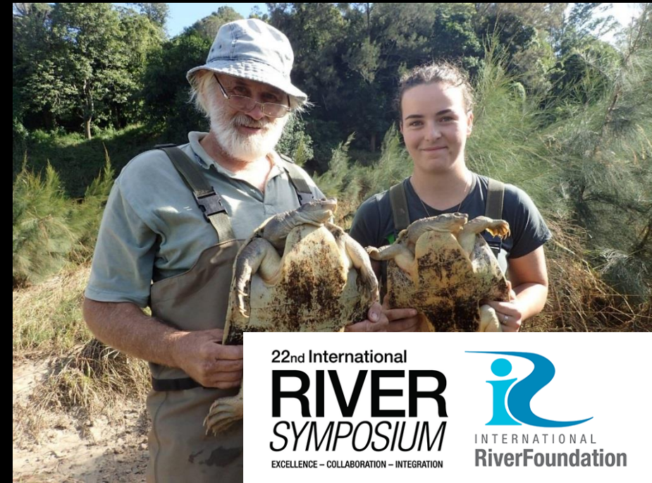
Mary River Turtle recovery